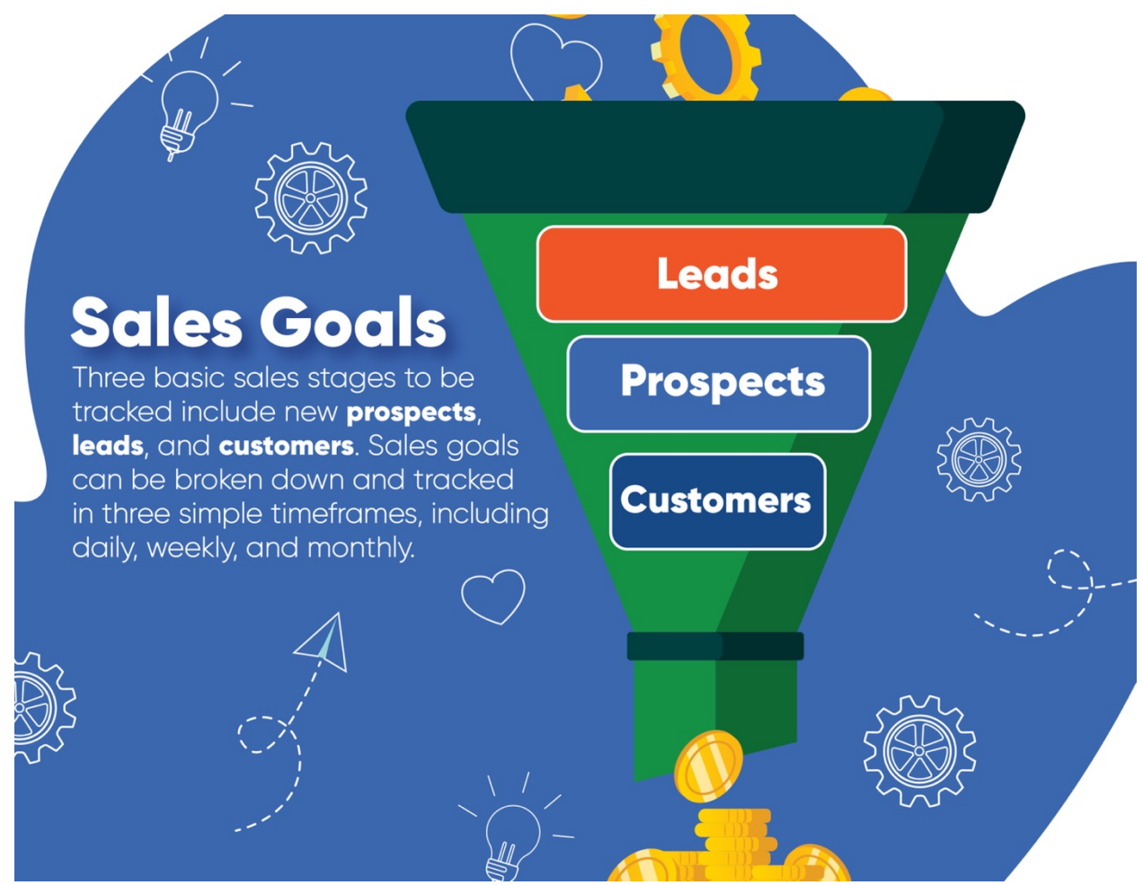
FIGURE: Sales Goals

Three basic sales stages to be tracked include new prospects , leads , and customers ( Figure: Sales Goals ). These goals represent the three different stages a customer enters during the sales cycle.