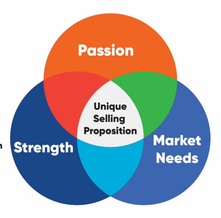
FIGURE: Unique Selling Proposition

A unique selling proposition or USP, is the factor that makes one business desirable over another. It helps the business to stand out in the market and increases the consumer's likelihood of doing business with that brand.